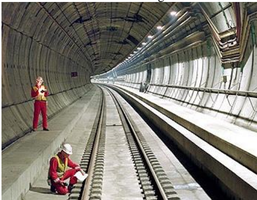
Figure 2. Major geotechnical projects (Briaud, 2013, http://www.oobject.com/category/construction-of-the-burj-dubai/ ,