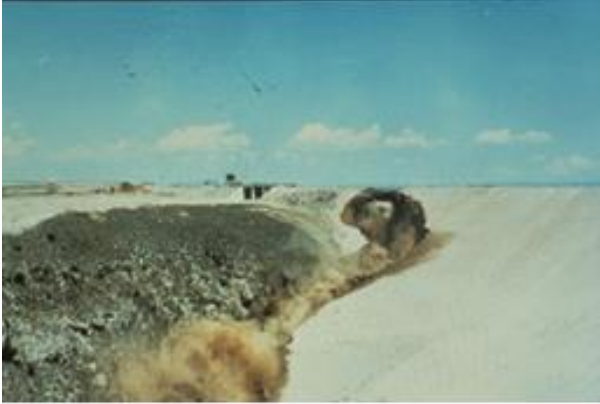
Transcona Silo Failure