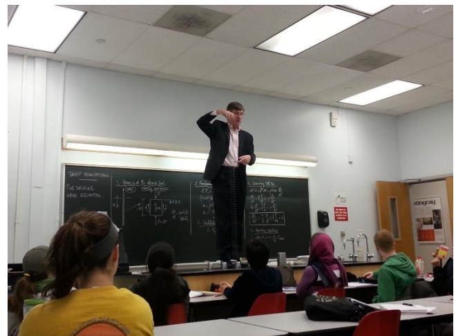
Figure 5. Demonstrating wave propagation using a slinky