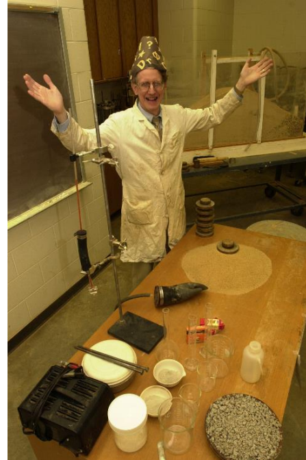
Figure 4. Soil magic (Elton, 2015)