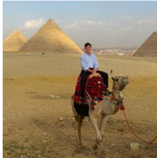
Figure 1. The Pyramids in Cairo, Egypt

While it is commonly agreed that geotechnical engineering started with the work of Karl Terzaghi at the beginning of the 20th century, history is rich in instances where soils and soils-related engineering played an important role in the evolution of humankind. In prehistoric times (before 3000 BC), soil was used as a building material and as foundation for engineering structures (Fig. 1). Underground structures started to develop in ancient India and Egypt. In ancient times (3000–300 BC), roads, canals, and bridges were very important to warriors. In Roman and Greek times (300 BC–300 AD), structures started to become larger and foundations could no longer be ignored.