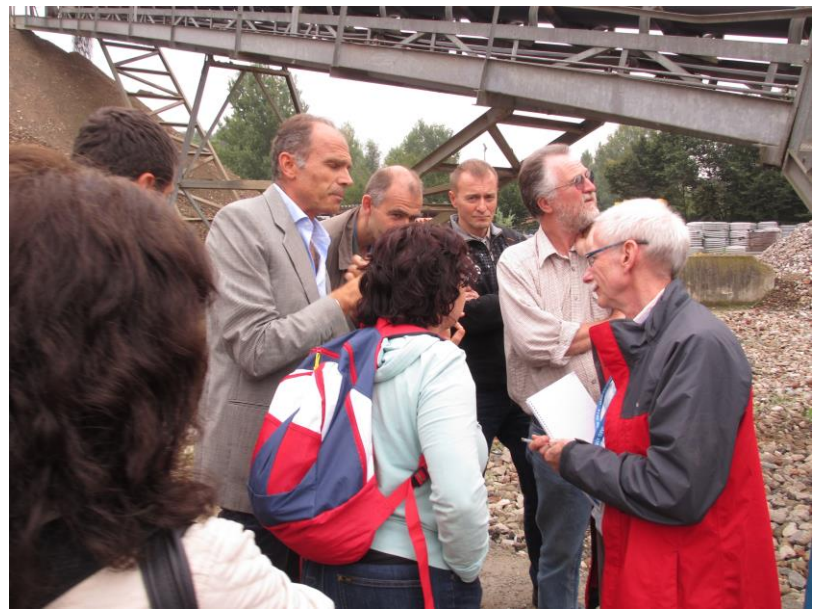
Visiting recycling aggregate plant by Commission members.