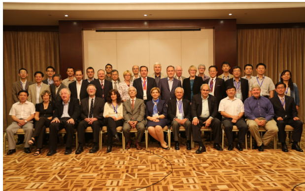
Photos of the Council meeting 2013 in Beijing

New Bylaws http://www.iaeg.info/Documents/Bylaws_2013.pdf