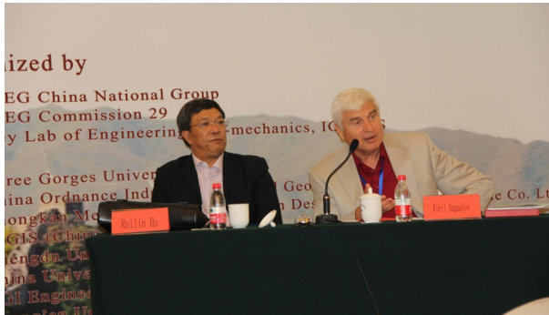
The chair of the workshop